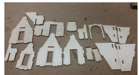
Walls 1A thru 1L and Alcove roof panels