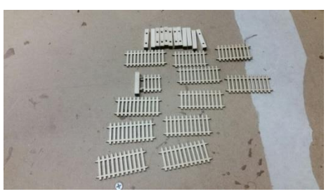
13 post and 11 fences With one gate