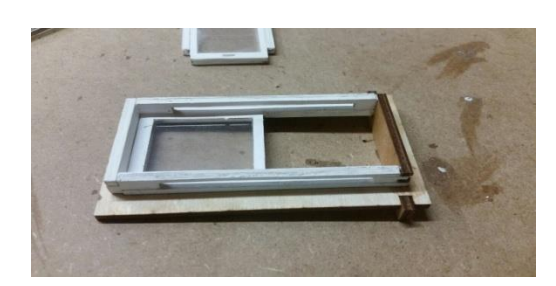
Figure 10 Figure 11 Figure 12