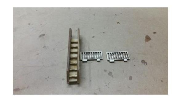
1 set of stairs and safety rails, 1:48 scale1:24 scale Houseworks straight staircase (assembly required)