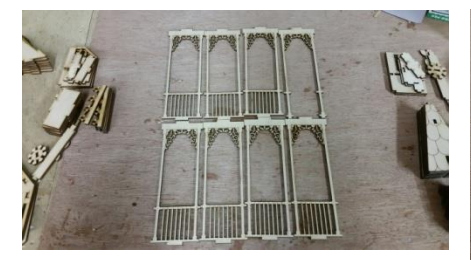
Frame Rails 7 enclosed 1 open