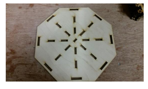
Roof base /ceiling