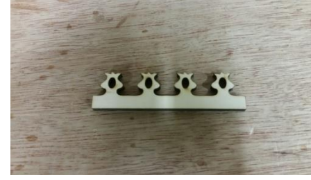
Roof Victorian trim