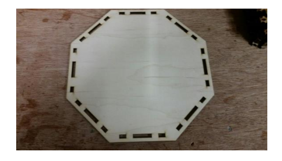
Main floor base