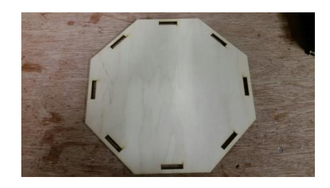
Lower Floor base