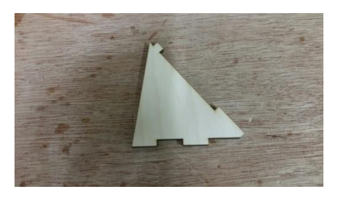
Roof support frames