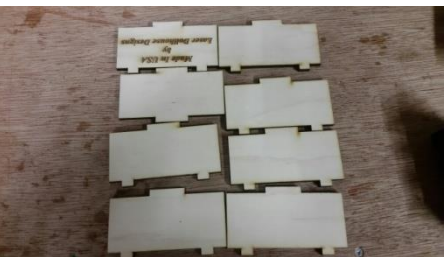
Base floor supports