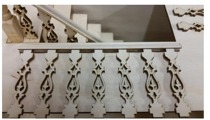
Figure 4 Figure 5