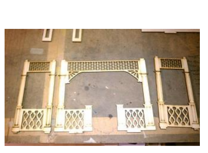
Porch rails 1A, 1B & 1C