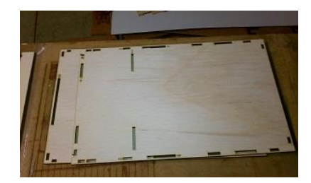
1<sup>st</sup> and 2<sup>nd</sup> Floors