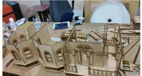
Figure 2B Figure 3 Figure 4