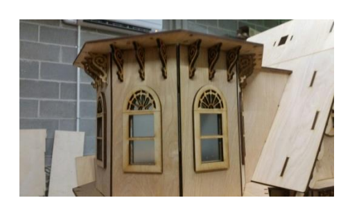
Figure 24 Figure 25