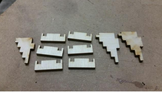
Porch stairs assembly