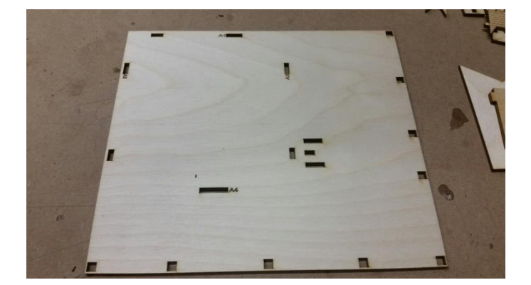
Base for yard marked A1 thru A4