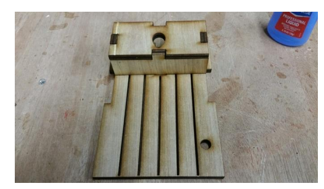
Figure 1 Figure 2 Figure 3