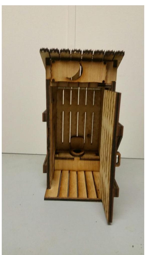
The Outhouse is now complete. Time for some TP!!!

Laser Dollhouse Designs www.laserdollhouses.com