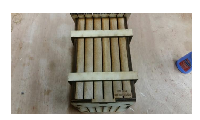
Figure 10 Figure 11 Figure 12